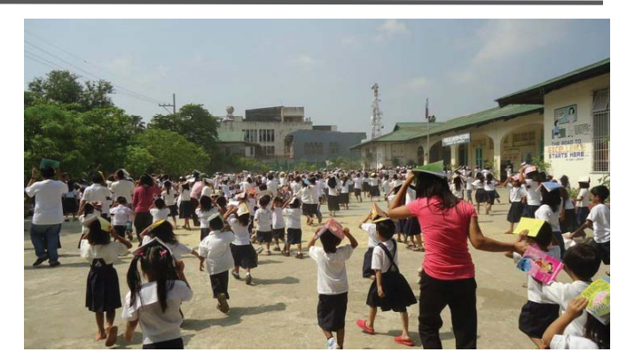
Teachers and students of Barangay Central West conduct an earthquake drill as part of their Community-Based Disaster Risk Reduction and Management, and Early Warning System.